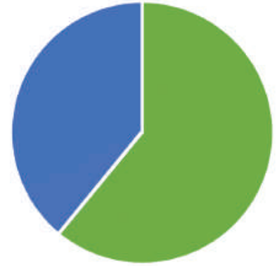
Nature of Funds