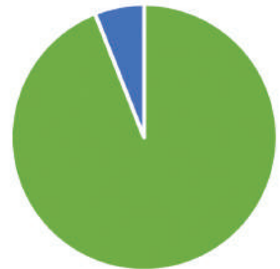
Utilization of Funds